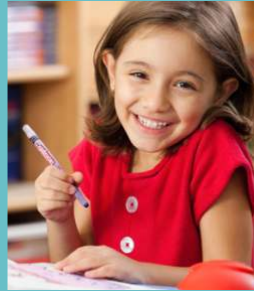
Our children benefit from special ability groups

OUR TWO YEAR GROUPS are taught in a variety of settings so that our children benefit from working with both banded and mixed-ability groups. We have a long-established tradition of recognising individual needs and by creating special ability groups, we enable all our children to realise their full potential.